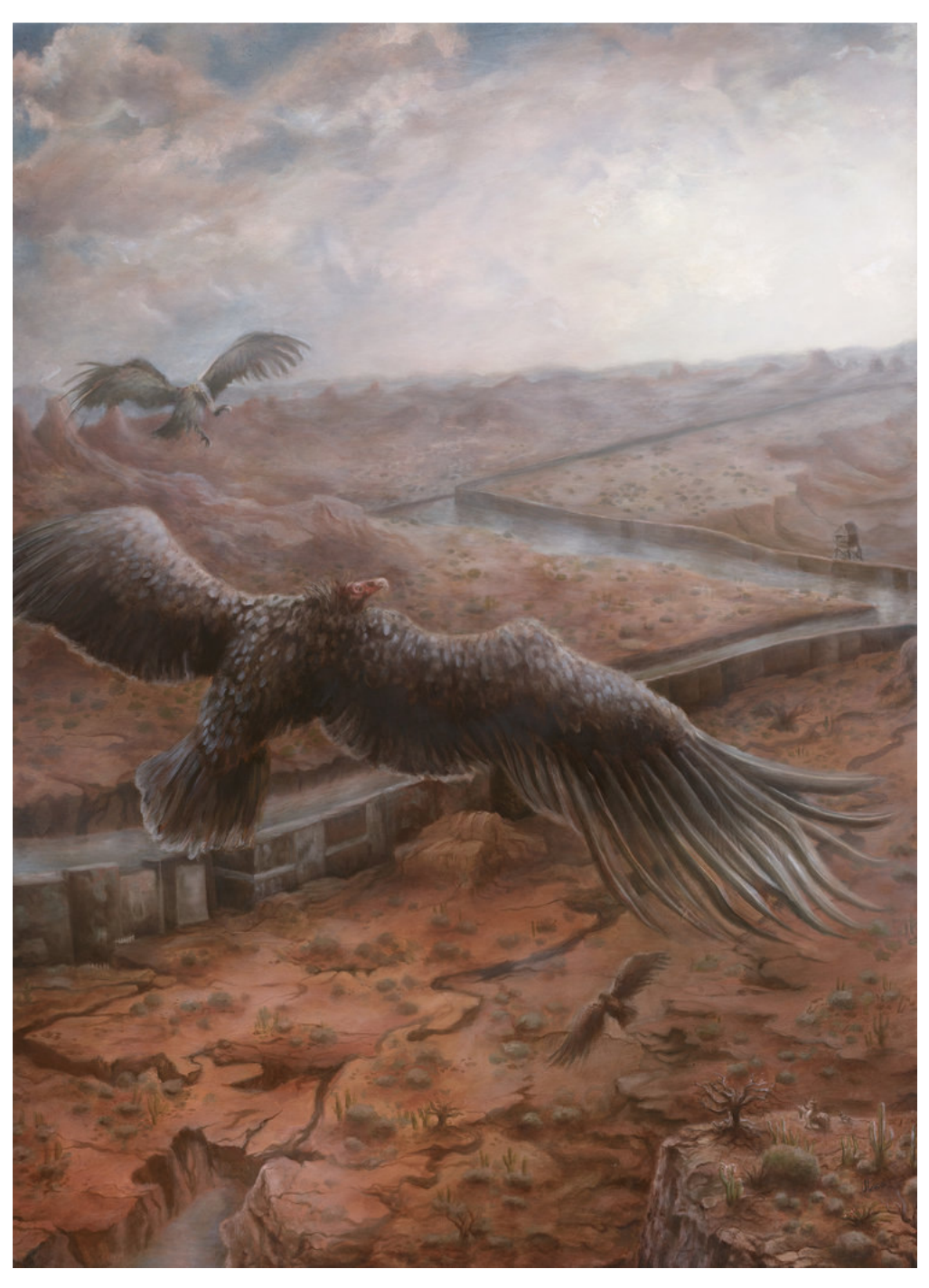
One Declination, Under God For prints of this painting, click <u>here</u>.